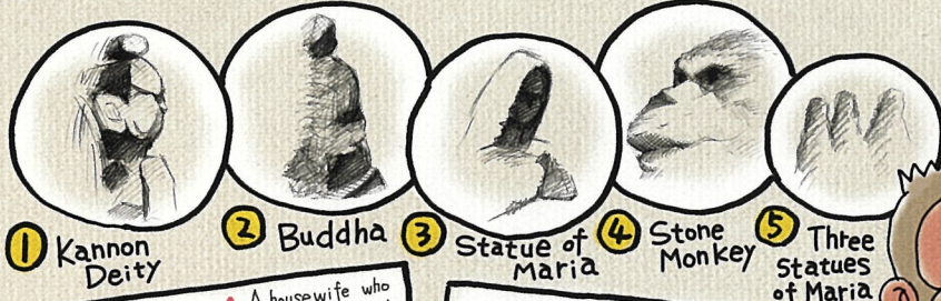
1 Kannon Deity

Here at Saruodaki Waterfall you will receive endless benefits! Or so they say... Thanks to all of the Buddha Statues throughout the waterfall park.